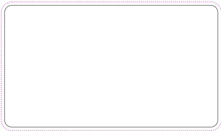
—— Size: 2.125"x3.375" - - - - - Bleed Area: 2.245"x3.839"

Item# 000SUB Size: Under 9 sq/in. Bleed Area: 1/16" from edge